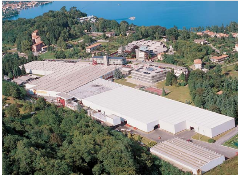
Giacomini s.p.a Headquarters, Italy.