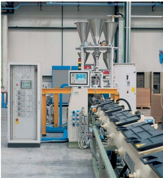
Giacomini Plastics Factory, San Maurizio.